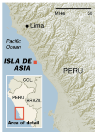
The New York Times