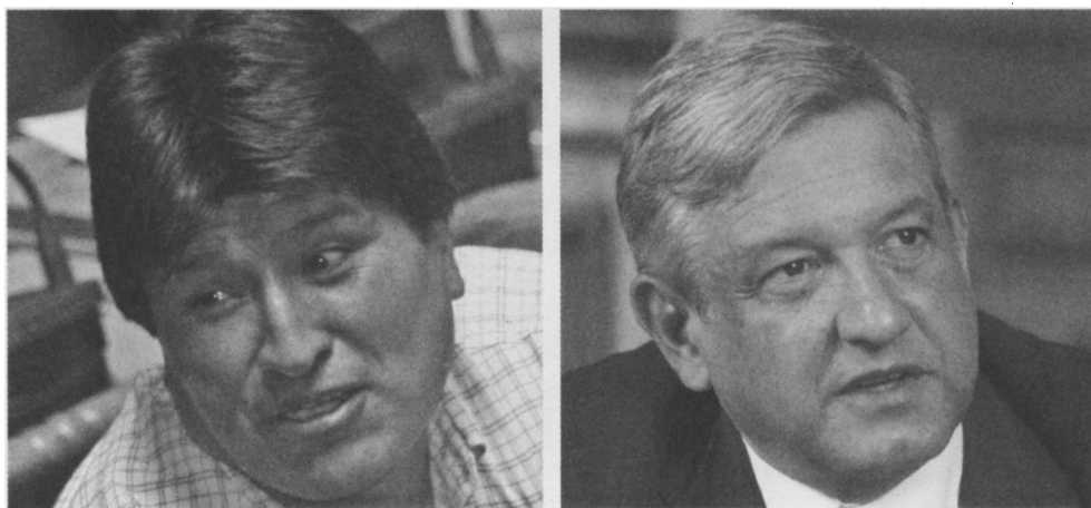
And another: Bolivia's Evo Morales and Mexico's Andrés Manuel López Obrador

center coalition since 1989, the region has had singularly unimpressive economic growth rates. They remain well below those of the glory days of the region's development (1940–80) and also well below those of other developing nations—China, of course, but also India, Malaysia, Poland, and many others. Between 1940 and 1980, Brazil and Mexico, for example, averaged six percent growth per year; from 1980 to 2000, their growth rates were less than half that. Low growth rates have meant the persistence of dismal poverty, inequality, high unemployment, a lack of competitiveness, and poor infrastructure. Democracy, although welcomed and supported by broad swaths of Latin American societies, did little to eradicate the region's secular plagues: corruption, a weak or nonexistent rule of law, ineffective governance, and the concentration of power in the hands of a few. And despite hopes that relations with the United States would improve, they are worse today than at any other time in recent memory, including the 1960s (an era defined by conflicts over Cuba) and the 1980s (defined by the Central American wars and Ronald Reagan's "contras").